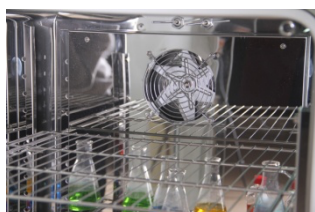
Motor Fan for Forced Air Circulations