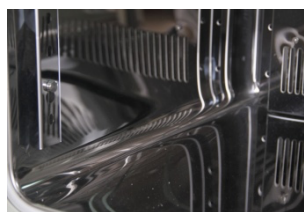
Covered Corner for Easy Cleaning