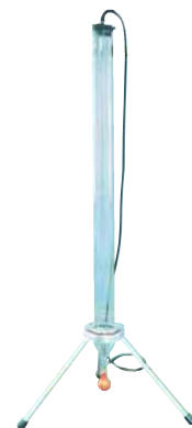
Laboratory Film Flowmeter Cat. No. 311-1000